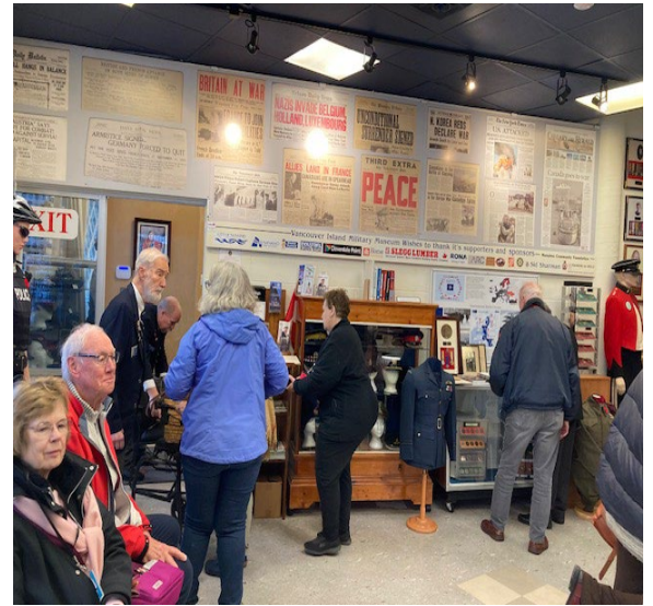
Military Museum in Nanaimo

Tea and Tales: We organized refreshments and presentations by guest speakers.