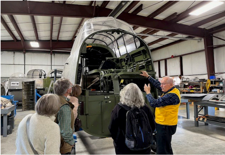
BC Aviation Museum in Sidney.

Mystery History Tours: We organized 4 group tours to places of historic interest and used some of our funds for entrance fees and gratuities for tour guides.