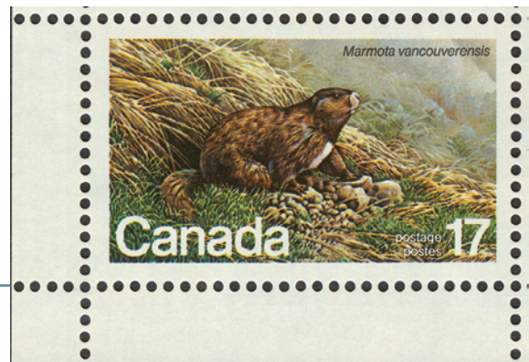
FIGURE 2.16: The at-risk marmot is one of Canada's most significant species

The Cowichan Valley Regional District is home to a significant proportion of the remaining wild population of the Vancouver Island marmot, a globally rare subspecies (Figure 2.16). It is red-listed in BC, and endemic to Vancouver Island. Unusually, compared to many of the other species of concern within the regional district, the marmot is a high-elevation species, historically living in the alpine and treeline areas, and – more recently – primarily inhabiting recently logged habitats where they are thought to be more vulnerable to predation. With the exception of Mount Washington, all known active colonies are located within five adjacent watersheds – the Nanaimo, Cowichan, Chemainus, Nitinat and Cameron River drainages – with 90% of the estimated population in the year 2000 found within this 150 km 2 . The CVRD obviously plays a key role in the recovery of this species (Figure 2.17).