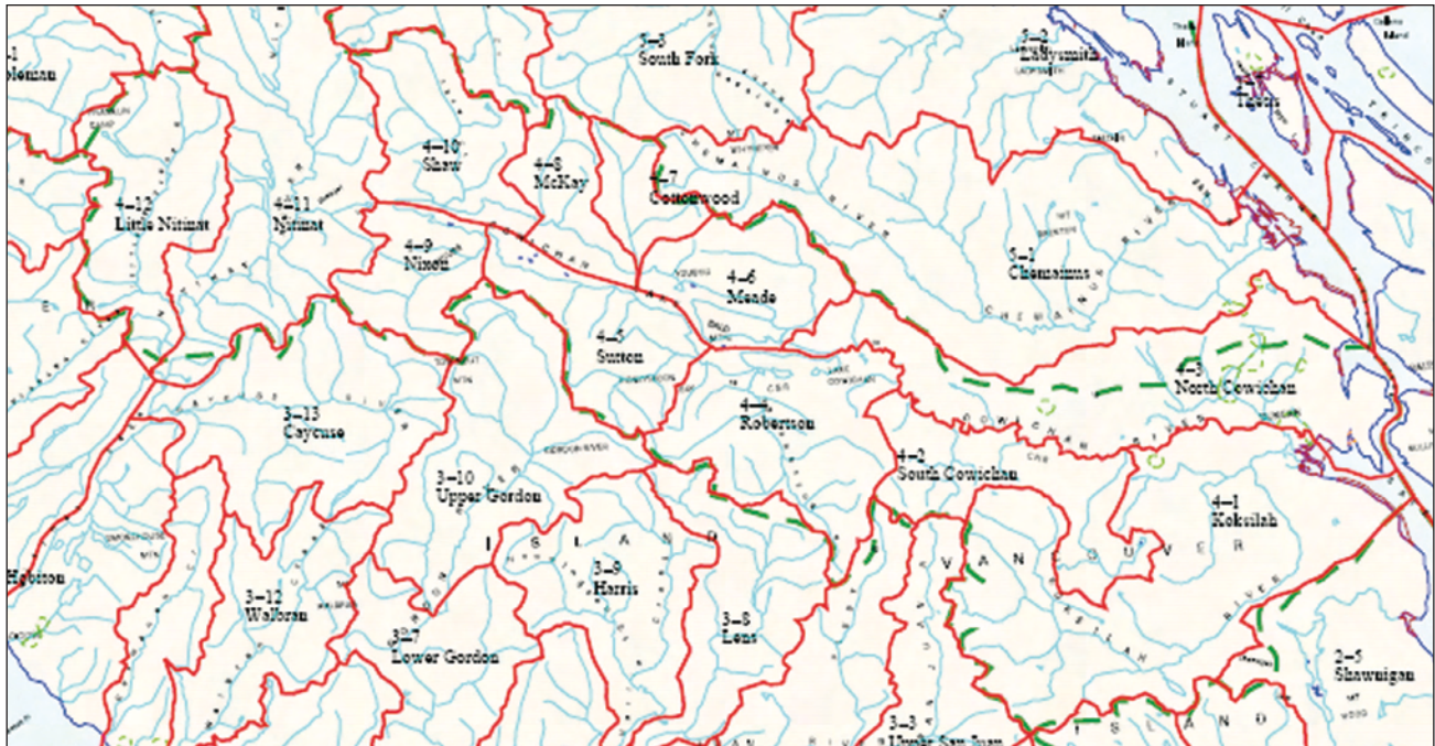
FIGURE 2.19: Location of population sub-units for Roosevelt elk, relevant to the CVRD