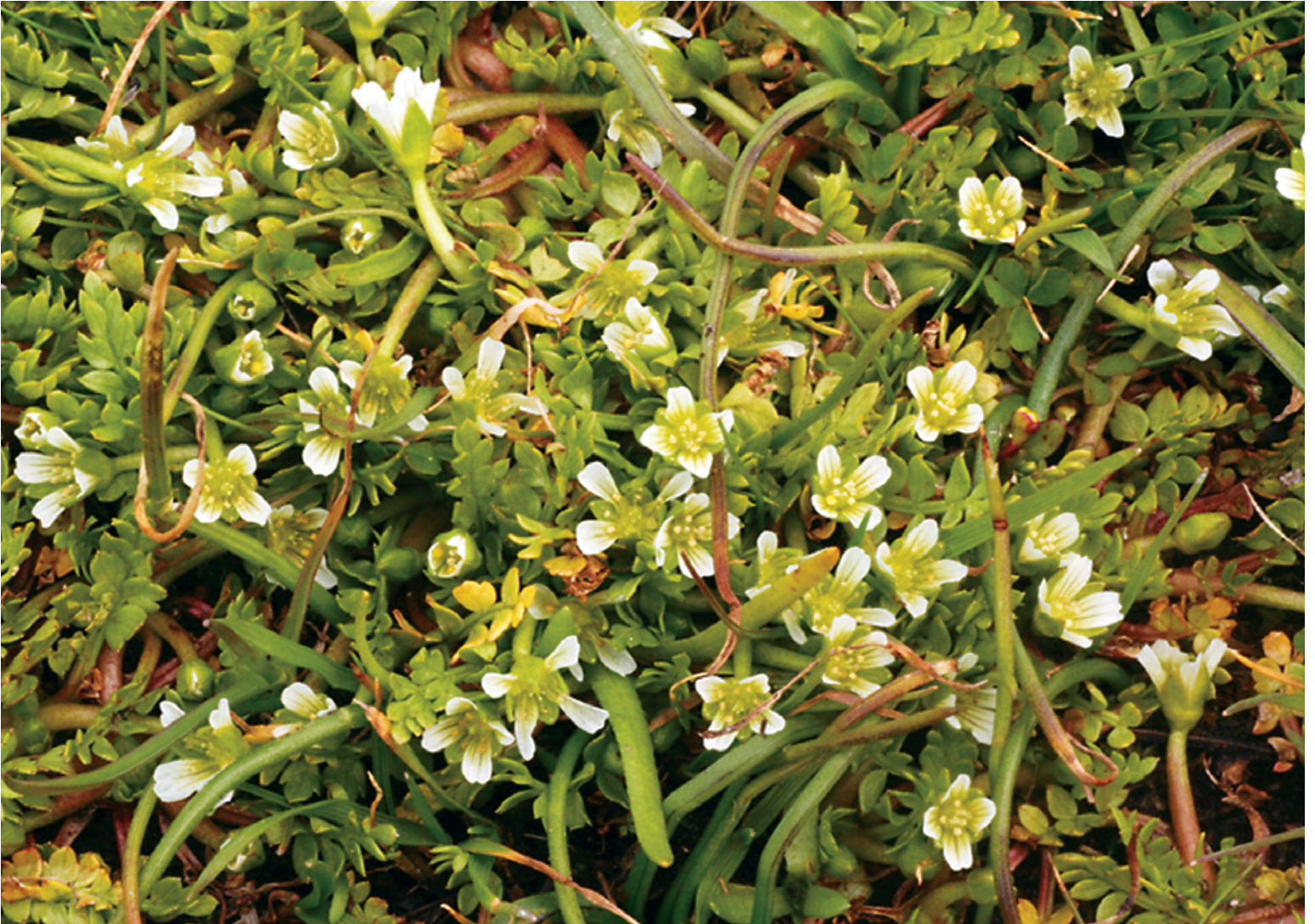
FIGURE 2.20: Macoun's meadowfoam