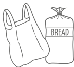
GROCERY BAGS & BREAD BAGS