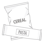
CRINKLY NOODLE & CEREAL PACKAGING