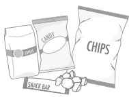
CRINKLY POTATO CHIP BAGS & SNACK BAR WRAPPERS